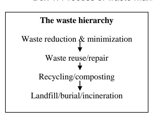
Box 1. Process of waste management

What types and volumes of waste are being produced every day? Are their any hazardous wastes that require attention such as disposable needles, broken glass or plastic – Ask the sanitary workers onsite, they will provide an assessment. The process of disposal is sequential and ensures safe and scientific disposal.[see Box 1]